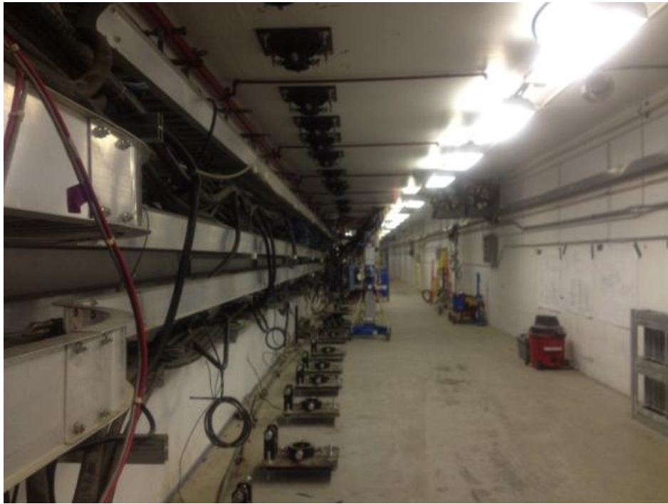
New 1R top and base plates