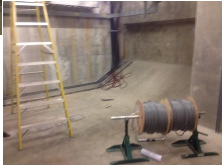
Arc10 BPM cables